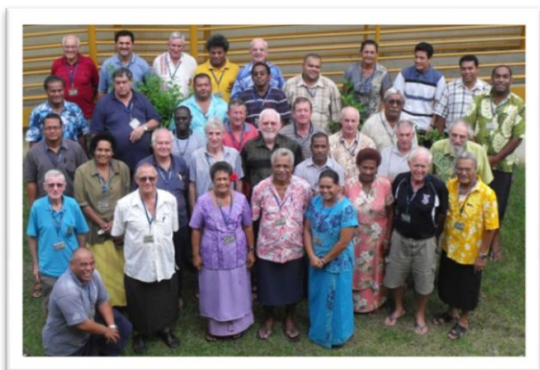
Not Kiribati we know but at the gathering of the Fiji, Samoa and Kiribati assembly - members came together for a photo