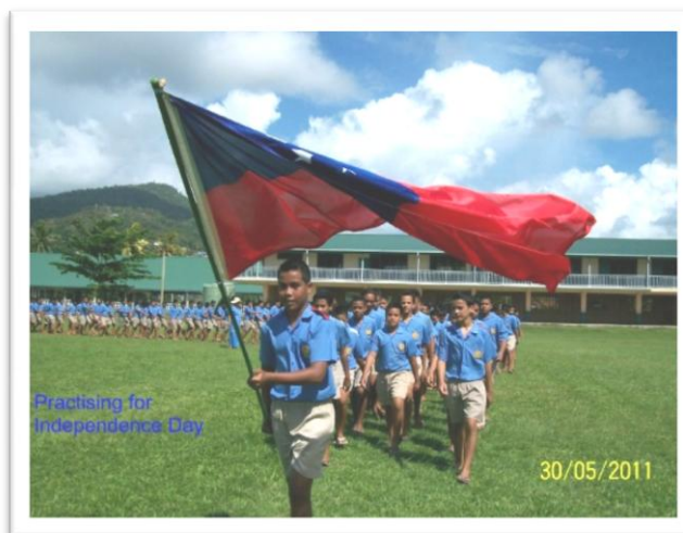
Marist Mulivai pupils preparing for Independence Day celebrations this year.