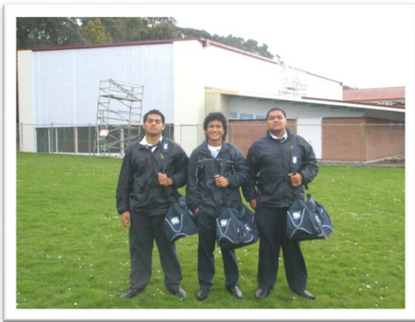
Three Marcellin College First XV players who made the Auckland Under 18 Divisional team pose proudly in front of their gym which is under construction